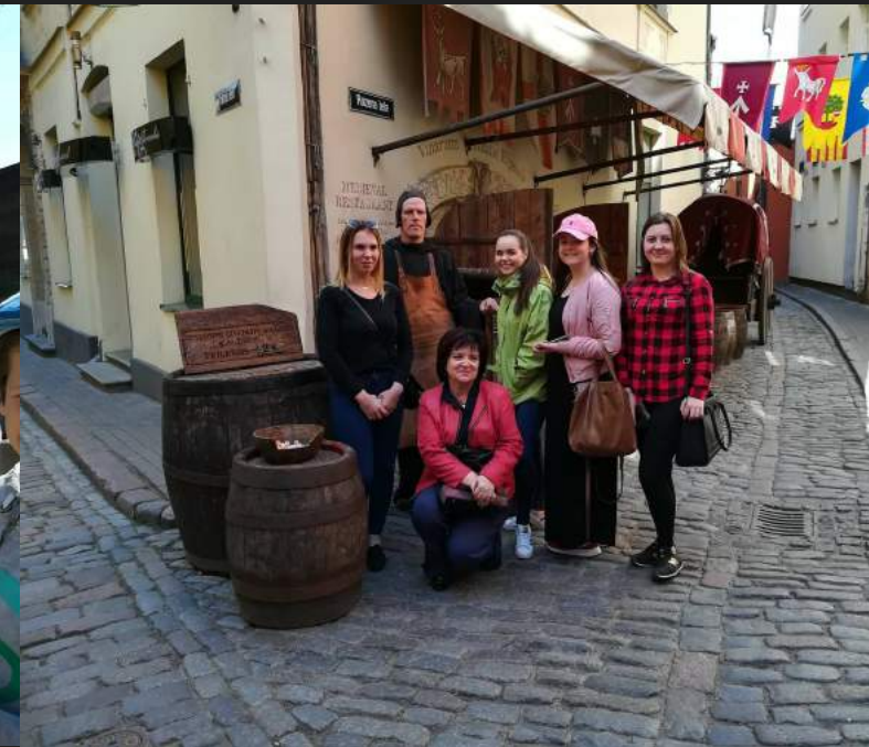
Ryga – Muzeum Motoryzacji, Stare Miasto... Riga – Automobile Museum, Old Town...